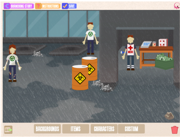
Figure 1: Outdoor scenario. Game designers can drag&drop objects and characters from the library and specify how these interact with each other.

Players not only earn points in accordance with the accuracy of their associations, but also for their speed in creating affective matches. The game is able to collect new pieces of affective common-sense knowledge by randomly proposing multi-word expressions for which no affective information is known. The aggregation of this information generates a list of affective common-sense concepts, each weighted by a confidence score proportional to an inter-annotator agreement, which is therefore highly useful for opinion mining and sentiment analysis (Cambria, Olsher, and Rajagopal 2014).