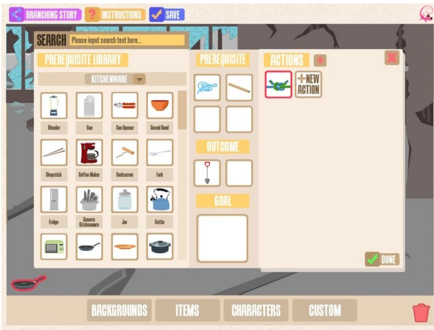
Figure 4: Specification of a POG triple. By applying the action ‘tie’ over a ‘pan’, in combination with ‘stick’ and ‘lace’, a shovel can be obtained.

The POG specification is among the most effective means to collect common-sense knowledge, given that it is performed quite often by the game designer during the creation of scenes. From a simple POG definition we may obtain a large amount of knowledge, including interaction semantics between different objects, prerequisites of actions, and the goals commonly associated with such actions. These pieces of common-sense knowledge, are very clearly-structured, and thus easy to assimilate into the knowledge base, due to the fixed framework for defining interaction semantics.