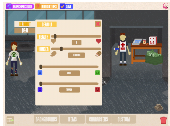
Figure 3: Status of a new character in the scene who is ill and extremely hungry, plus has very low levels of pleasantness (grief) and sensitivity (terror).

Towards the goal of improving gameplay, and because we are mainly interested in typical common-sense knowledge, POG triples associated with a specific object type are shared among all the instances of such an object (‘inheritance’). Whenever a game designer associates a POG to an object in the scene, that POG instantly becomes shared among all the other objects of the same type, no matter if these are located in different scenes. New instances inherit this POG as well. Game designers, however, can create exceptions of any object type through the creation of new custom objects. A ‘moldy bread’ custom object, for example, normally inherits all the POGs of ‘bread’ but these can be changed, modified, or removed at the time of object instantiation without affecting other ‘bread’ type objects.